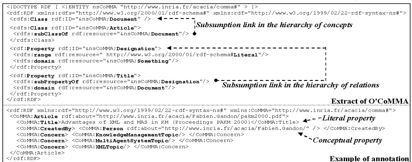
Figure 1. RDF(S) Sample

Likewise, the users' profile captures all aspects of the user that were identified as relevant for the system behavior. It contains administrative information and preferences that go from interface customization to topic interests. It positions the user in the organization: role, location and potential acquaintance network. In addition to explicitly stated information, the system derives information from past usage by collecting the history of visited documents and possible feedback from the user. From this, agents learn some of the user's habits and preferences [15]. These learnt criterions are used for interfaces or information push.