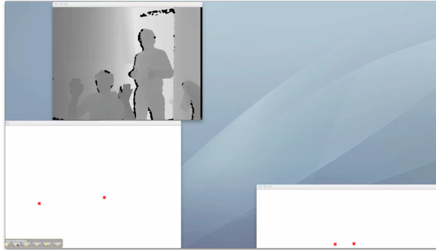
Figure 2: In this picture, users are tracked and each movement of both hands as well as that of the user's center of gravity is mapped to a dedicated window.

In Figure 3, we show the interaction of a user with a regular application, in this case TextEdit. The user is able to move the mouse with his dominant hand.