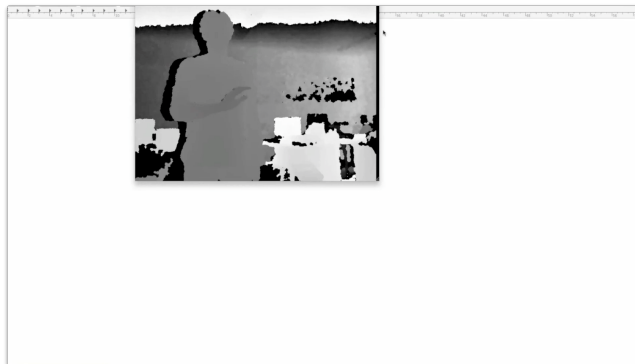
Figure 3: interaction with regular application, user movements are mapped to a mouse pointer, the location of the window can also be manipulated by the user's location.

In Figure 3, we show the interaction of a user with a regular application, in this case TextEdit. The user is able to move the mouse with his dominant hand.