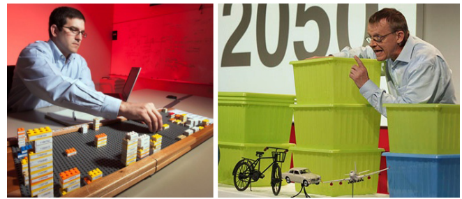
Figure 2: Manually-updated physicalizations used by an automotive engineer (left, image © General Motors) and by Hans Rosling during a public talk (right, image © TED).

To further illustrate the potential of data physicalizations, we provide three usage scenarios which are fictional and to a large extent ignore current technological limitations.