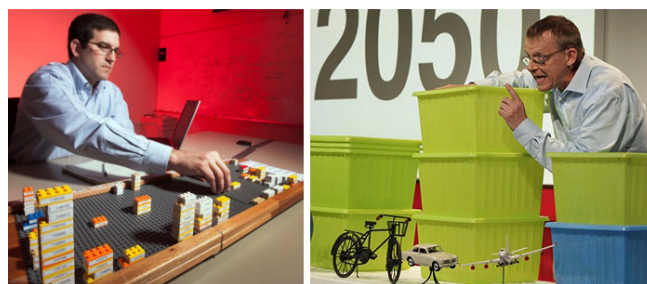
Figure 2: Manually-updated physicalizations used by an automotive engineer (left) and by Hans Rosling during a public talk (right).

To further illustrate the potential of data physicalizations, we provide three usage scenarios which are fictional and to a large extent ignore current technological limitations.