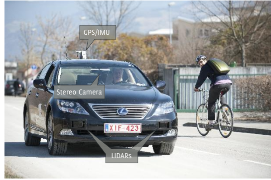
Fig. 2. Experimental platforms: left ) Torcs racing simulator; right ) sensor-equipped Lexus vehicle.