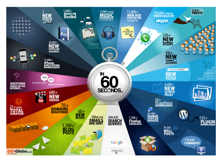
Fig. 1. Things That Happen On Internet Every Sixty Seconds. By Shanghai Web Designers, http://www.go-gulf.com/60seconds.jpg.