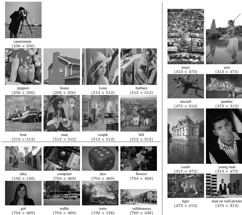
Figure 1: Set of 25 tested images. Top left: images from the BM3D website ( cs.tut.fi/foi/GCF-BM3D/ ) ; Bottom left: images from IPOL ( ipol.im ); Right: images from the Berkeley segmentation database ( eecs.berkeley.edu/Research/Projects/CS/vision/bsds/ ).

performant but PEWA is able to produce better results on several piecewise smooth images while BM3D is more appropriate for textured images.