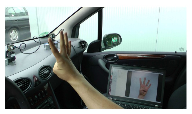
Fig. 2: A sample recording from the Live Demonstration

six hand gestures. While the results remain unclear, except for the fact that gestures could be well accepted as a means of control in a car, the gesture set remains small and the effect of different lighting conditions on the results is not discussed. More comprehensive overviews are given in [11] and [12].