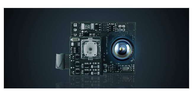
Fig. 1: The Camboard nano