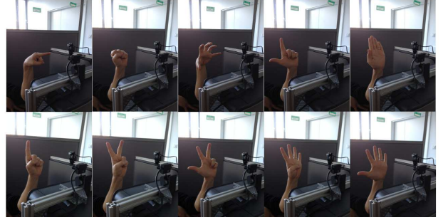
Fig. 2: The hand pose database

In its nature a support vector machine (SVM) is a binary classifier, yet there exist several methods to extend it for multi-class problems (e.g. one-versus-all or one-vs-one). In our experiments we chose to use the one-vs-one ([18]) approach in combination with crossvalidation. The method can be roughly described as follows; let N be the number of classes, x \in \mathbb{R}^k a feature vector and k_p : \mathbb{R} \times \mathbb{R} \rightarrow \mathbb{R} an arbitrary kernel parametrized by a set p . In one-versus-one the amount of SVMs to be trained is N(N-1)/2 =: P , i.e. one trains an SVM for each possible two-class combination. Formally stated, if \tilde{x}_{i,\gamma,\delta} represents the i -th support vector (SV) for classes \gamma, \delta , \tilde{\alpha}_{i,\gamma,\delta} the corresponding coefficient and b_{\gamma,\delta} the