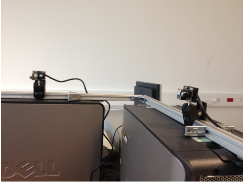
Fig. 1: The current setup for 90°

necessarily wish for every classification to be taken seriously, and we define several confidence measures \text{conf}(\{o_i\}) to this effect. Final decisions are thus taken in the following way: