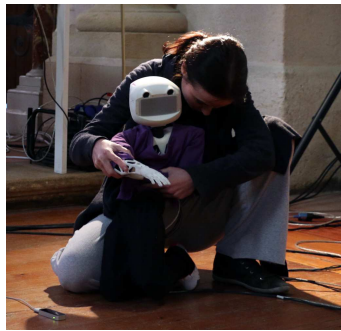
(b) Physical interaction