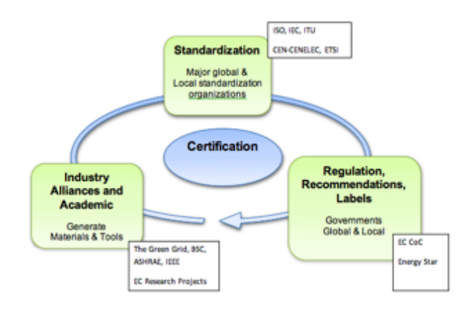
Fig 1: Standardization stakeholders

On Figure 1, one can see that the first providers of materials and tools that may make their way to actual standards are industry alliances, academic researchers, or both in collaborative projects. Some of the proposed ideas may be presented in one or several standardisation bodies to eventually become standards. These standards can in turn be used by governments (national, federal or European levels) as regulations in laws that must (and can) be enforced. Governments can use directly the materials as regulations, recommendations or labels. While the process for formal standardisation take a long time since a consensus have to be achieved between all members (especially states), the direct link with governments is sometimes more efficient. Finally, it must be noted that some metrics, tools, and methods provided by industry and academia are used directly by final users and may become de facto standards. In the centre of the Figure is the certification authority whose role is to certify that the measurements, claimed by suppliers of technologies actually follow the standards, the labels or the recommendations.