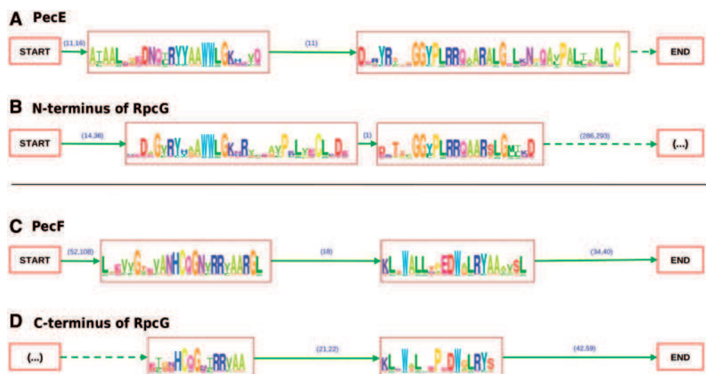
Figure 2. Example of motifs created by Protomata learner for members of the E/F subclass 1. Motifs for the PecE (A) and PecF (C) subunits of the PCB:Cys-84 \alpha -PEC lyase-isomerase PecE/F(12) and for the corresponding N-terminus (B) and C-terminus (D) of the closely related fusion protein RpeG, a PEB:Cys-84 \alpha -PC lyase-isomerase (9). Note the similarity of motifs independently found by Protomata learner for these two sets of protein sequences, and in particular the presence of the well-conserved motifs YyaAWWL, biochemically characterized as essential for the lyase activity of PecE (13) and nHCQGN, conferring its isomerase activity to PecF (13), in the N- and C-terminus of RpeG, respectively.

The 'Pigmentation' page displays the PBP content for each strain listed in the genome page and the chromophores found at the different binding sites of PBP subunits. The latter information was either determined biochemically (bold letters) or predicted by CyanoLyase authors (normal letters), based on the presence of specific phycobilin lyases in the genome.