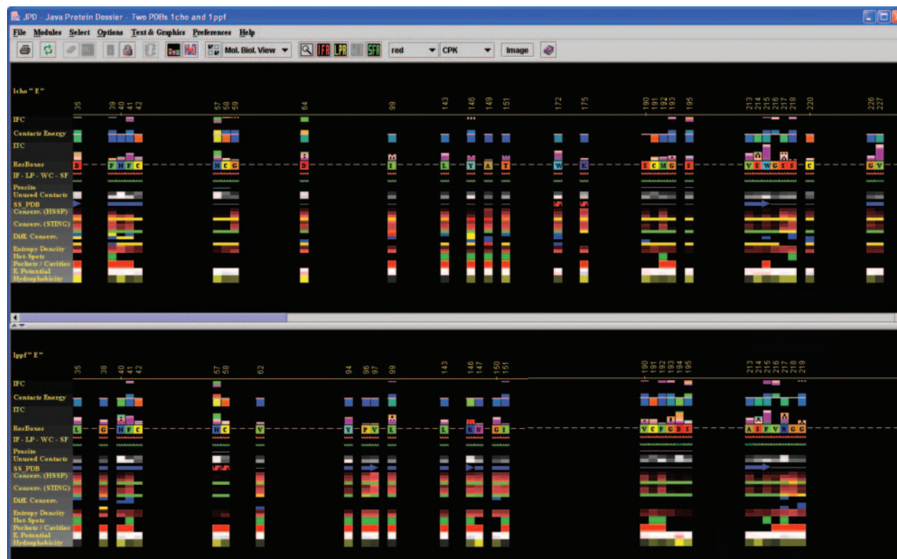
Figure 2. Structural alignment in J PD. This is one of the key features that J PD offers to users—the possibility to structurally align two proteins and consequently display ‘aligned’ structural parameters. In this case, we used two serino proteases: Chymotrypsin in complex with turkey ovomucoid third domain (1cho.pdb) and elastase in complex with the same inhibitor (1ppf.pdb). As a result of the alignment, Gold Sting shows, in the Chime window, two aligned structures and, in the Gold Sting sequence window, the sequences of two chains, aligned according to the structural alignment. This particular picture was obtained after clicking on the IFR icon in the J PD speed icons area. The displayed pattern shows only the residues at the interface area of the two aligned chains. After the user selects to view only the IFR region, J PD continues to preserve the alignment mode, so that the user can inspect the spatial position of these important ‘interfacing’ residues (of course in comparison with the homologous and aligned structures). This clearly offers a rapid insight into the mechanism of the specificity for certain substrates/inhibitors. In this specific case, we see two different enzymes binding to the same inhibitor. Both enzymes demonstrate a similar pattern of IFRs, yet variations between the two ensembles of IFRs should suggest the key elements responsible for the successful binding of the inhibitor to both enzyme chains.

implemented SMS DB (Sting Millennium Suite Database) [described earlier by Neshich et al. (6)]. The server side of Gold Sting is responsible for regularly taking updates from all relevant public domain databases used by Gold Sting: PDB, HSSP (Homology-derived Structures of Proteins) (8–10) and PROSITE (11). At the same time, the Gold Sting server is also responsible for calculating a number of macromolecular properties for each PDB structure: electrostatic potential is calculated using modified Delphi (12) software (details will be discussed elsewhere); curvature is calculated using the SurfRace (13) software; solvent accessible area for each protein chain and for the whole molecular complex is calculated using the Surfv (14) software, adapted to our own requirements; secondary structure identification is calculated according to DSSP (15) and STRIDE (16); intra- and interchain amino acid contacts as well as protein–DNA interaction are calculated using our own software, ‘contacts’; hydrophobicity is assigned according to Radzicka and Wolfenden (17); dihedral angles are calculated by our own ‘Ramachandran’ program; and PROSITE patterns are identified using the Ps_Scan (18) software. The ‘Sponge’ and ‘Density’ parameters are