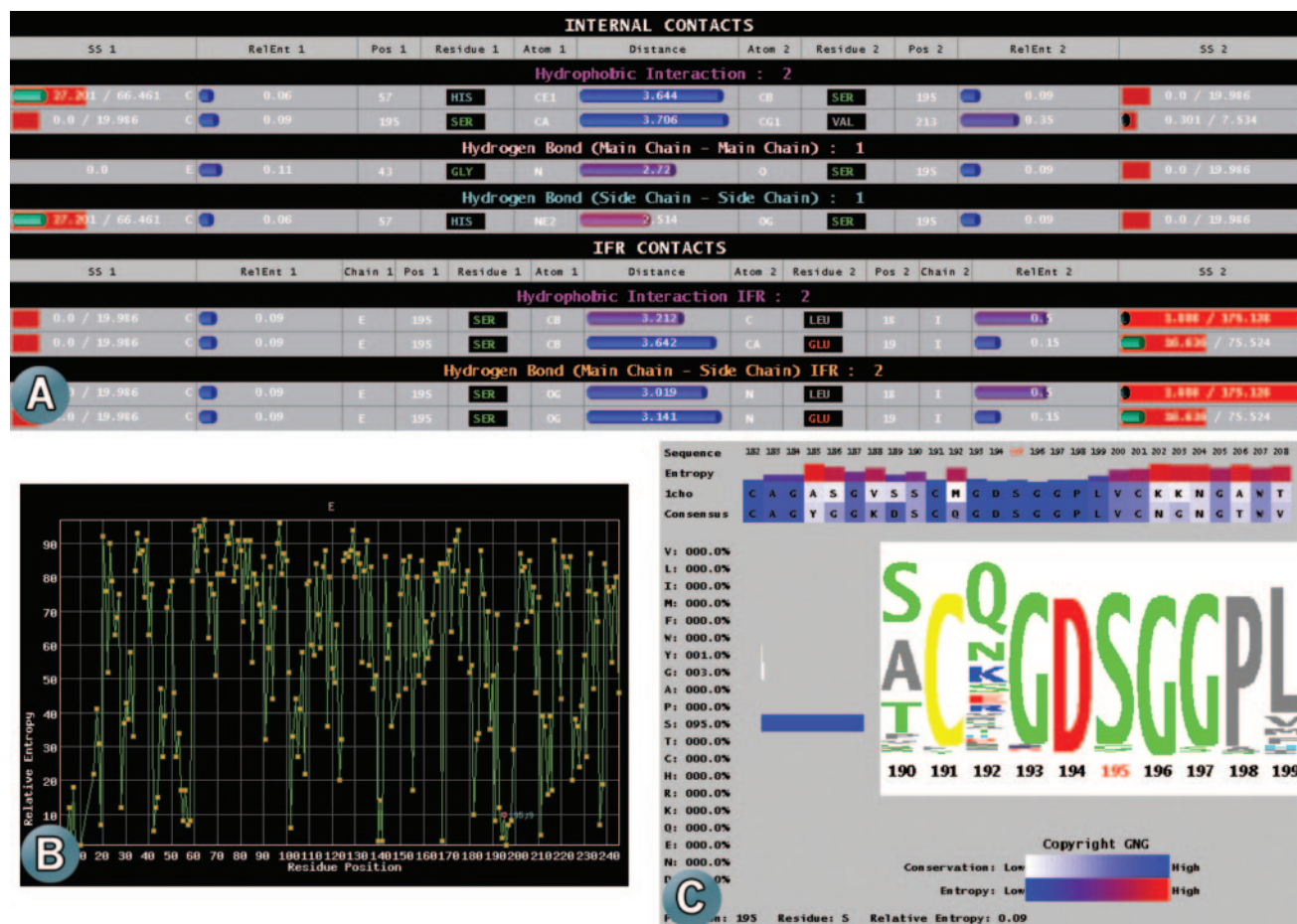
Figure 2. (A) The Java Table of Contacts ( J TC) image area with all the details of inter-atomic contacts of intra- and inter-chain type in a mixture of tabular and graphical presentation. On the left and right extreme part of the table a user can see the data describing a Secondary Structure element and the ASA value for the chain in the isolation and in a complex with the other chain. Next column toward the center of the table shows the Relative Entropy values. The next three columns bring the residue sequence number, the residue type and the atom which engages into a given contact. The central column shows the distance between the two atoms which are establishing a particular type of the contact. In order to aid a user in quickly grasping what are the shortest distances of the contacts or which are the contacts established among the most conserved residues, the J TC bar color-coded graph accompanies the numerical values. (B) This graph represents only one (out of five available) X–Y plot: the Relative Entropy based on the HSSP data. (C) The ConSSeq image based on the Gold STING SH 2 Q s (16) data. Both the logo and bars above the sequence indicate that the Serine 195 is a very conserved residue.

Relative Entropy based on the SH 2 Q s data and (e) the Temperature Factor; (vii) the Scorpion plot area which consist of two plots: (a) the first plot shows a frequency of occurrence for all amino acids belonging to the same chain as the selected residue and (b) the second plot shows a frequency of occurrence of the residues surrounding the selected residue and are counted if identified within a sphere of a given radius (see Figure 3D); (viii) the Formiga plot area which consists of three plots: (a) the first plot shows a frequency of occurrence for all amino acids belonging to the same chain as the selected residue and are at the interface, (b) the second plot shows a frequency of occurrence for all amino acids belonging to a chain other than the one to which the selected residue belongs and are at the interface and (c) the third plot shows a frequency of occurrence of the residues surrounding the selected residue and are counted if identified at the interface, belonging to the chain other than the one to which the selected amino acid belongs and are identified within a sphere of a given radius (see Figure 3C). The table area is divided into five content-related subtables, reporting numerical values for the sequence/