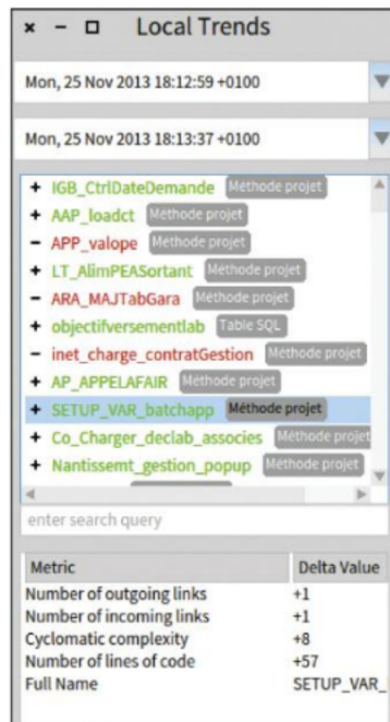
Figure 2: Trends analysis.

The fourth element is a trend analysis solution. Instead of a punctual picture of a system's software state, it is desirable to understand the evolution of the quality of entities. As the source code (and thus the software entities) typically evolve in integrated development environments, independently from the dedicated, off-the-shelf, software quality tools, computing quality analysis trends requires changes (e.g., add, remove, move or rename) of individual software entities identified. We propose a tool that computes such changes and the metric evolutions. Figure 2 shows the changes computed on two versions (green: entity added, red: entity removed) and the evolution of quality metrics for a change. Queries may be