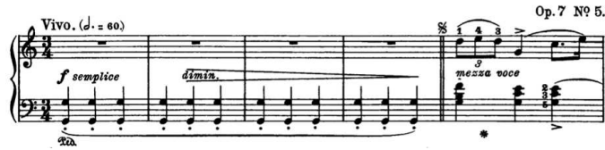
FIGURE 1. Music score of the Mazurka Op. 7 No. 5 by F. Chopin. It begins with a long sequence of repeated events, i.e. states with identical observation probabilities.

Our definition of time-coherency emerges from the following fact: music scores might be composed of very long sequences of “repeated events” such that the one in figure 1. What would happen if all states j \in E share the same observation probabilities? We call non-discriminative observation such a model where b_1 = b_2 = \dots \stackrel{\text{def}}{=} b . Note that this assumption may model other realistic situations of Bayesian inference such as missing observations [8].