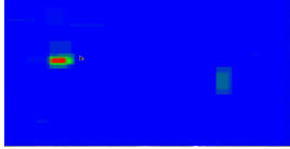
(b) Class Base