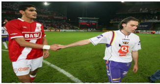
(a) Raw query image