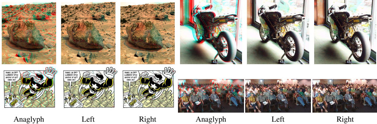
Figure 7. Examples of stereo pair reconstruction. We are able to handle object disocclusions and image boundaries to a certain extent. More examples can be found in the supplementary file.