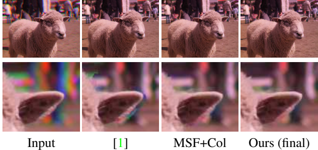
Figure 6. Comparison with Bando et al. [1] on images taken with their camera. “MSF+Col” refers to using our ASIFT-Flow (rough matching) and colorization. The right column is the result of applying our full algorithm. Notice that the results of our technique have less apparent edge artifacts.

The computed PSNR values of our algorithm are shown in Table 1. We see that our method performs better than the baseline. Note that recolorizing occluded regions does