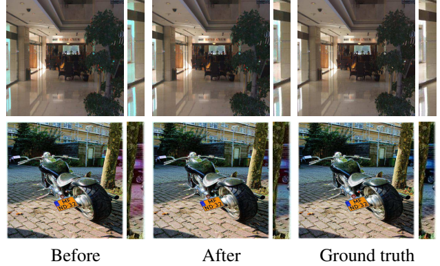
Figure 4. Examples of recolorization of occluded regions with incompatible colors.

Our approach uses the anchor colors to fill in the missing colors. However, objects in disoccluded regions may be incorrectly colored. As shown in Figure 4, for each scene, a border region of the leftmost image is unobserved in the other view, resulting in out-of-place colorization. To detect