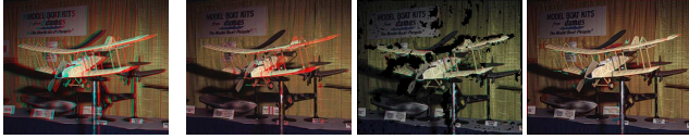
Anaglyph [10] [5] Ours