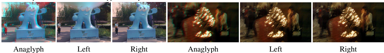
Figure 8. Robustness to asymmetric occlusion (left) and blur and low-light conditions (right). More examples can be found in the supplementary file.