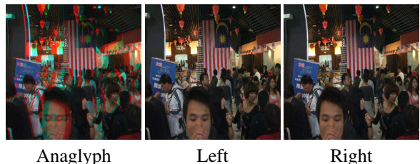
Figure 9. A representative failure case. The red and white part of the flag appears as uniform in the red channel in the left view, so registration in that area is less reliable.

not improve the PSNR significantly, mostly because the areas occupied by occluded regions are typically small (but obvious if colorized incorrectly).