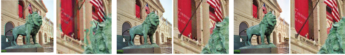
Figure 5. Comparison with Deanaglyph ( http://www.3dtv.at/Knowhow/DeAnaglyph_en.aspx ).