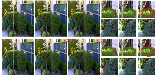
Figure 10. Results for an anaglyph video. Top row: three frames reconstructed independently. The highlighted areas (dotted ellipses) have inconsistent colors across time. Bottom row: results using temporal information. The colors are now more consistent. More examples are shown in the supplementary material.

Figure 10 shows results for an anaglyph video, which illustrate the importance of temporal information on preventing flickering effects caused by inconsistent colors across time. If the frames are processed independently, the resulting color inconsistencies tend to be local and minor, but noticeable.