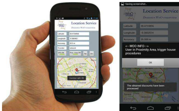
Figure 2: GNSS location-based automatic house entities requests

The results to date are very promising: we integrated the previous smart objects with many partners in order to compose an Open Smart Neighbourhood ecosystem on top of the Web of Objects platform. This allowed us to deploy and test some recent research results in projects related with the Internet of Things, Machine to Machine communication (M2M) and Ambient Intelligence systems development. We have acquired insight into the use of smart WoO objects such as mobile devices, user