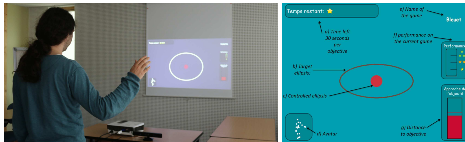
Fig. 1. a) Subjects are exploring how to control an ellipsis displayed on the screen in front of them by moving their body joints tracked by a Kinect device. b) Details of the interface shown to the user on a screen in front of them: in particular, you can see the controlled ellipsis (in red) and the target one (in brown).

This experimental setup is designed as a game setting human subjects into an intrinsically motivated activity [11]. Participants can freely explore and shift between several games, each being about finding a mapping between their movements (body joints