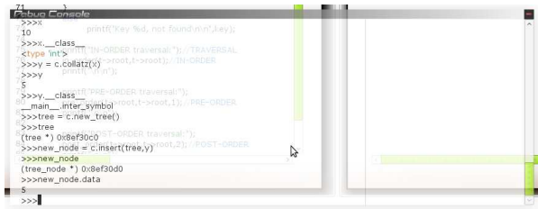
Fig. 4. Python to C, seamless inter-language calls

Foundation. In response to this interest and based upon the still experimental work done for i386 native reverse execution [?], we integrated and enhanced the execution record facility of gdb with our syntax-aware navigation system so that it is able to execute back in terms of complete syntactic structures, just as the programmer using the forward execution will have expected.