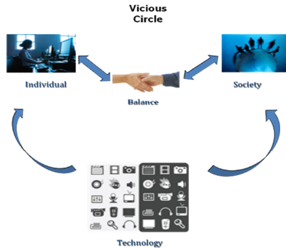
Figure 1. The constant development of data collection, aggregation and processing technologies results in a vicious circle as society attempts to seek a balance of protection between the individual's privacy and security of society.

In the field of privacy there is a constant debate over the relative importance of the individual right to privacy versus the common good for society [1, 4, 5, 13]. Legislation and regulatory procedures endeavour to establish functions that may find a balance between individuals' right to privacy and the common good. But every time a balance is found, the use of new technologies alters old norms either in favour of the individual or in the interest of the common good, and new norms and functions need to be re-established to restore the balance, thus forming a vicious circle.