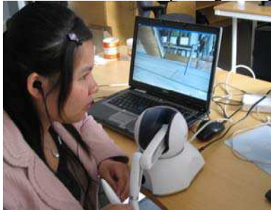
Fig. 3. User interacting with the haptic virtual environment using a PHANTOM Omni force feedback device

In the experiment, a Dell Precision Laptop with two dual core processors is used. One PHANTOM Omni, the haptic device, is connected serially to Laptop. For developing the application H3D API 2.0, X3D, Python as well as Visual Studio .NET 2003, are employed. H3D API can be used both as an API to implement X3D applications, and as a loader of applications built in X3D and Python. A video camera is used for recording purpose and Camstudio for screen capturing during the experiments.