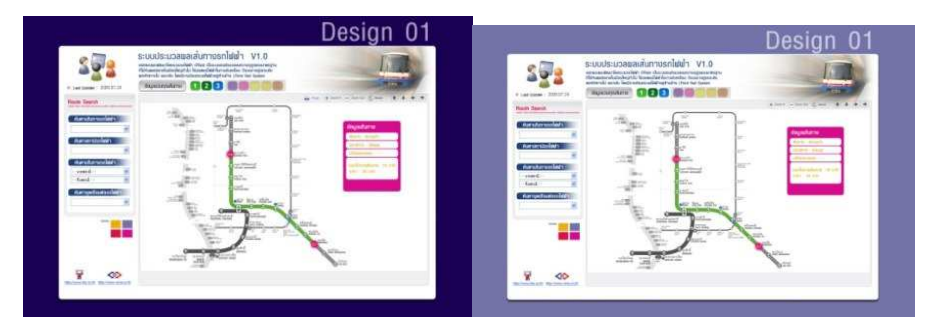
Fig. 5. The in-process screen design

The last suggestion made by users is to construct the information universal use, which is to make web site available in both Thai and English language as see the last adjustment in Fig. 6 below.