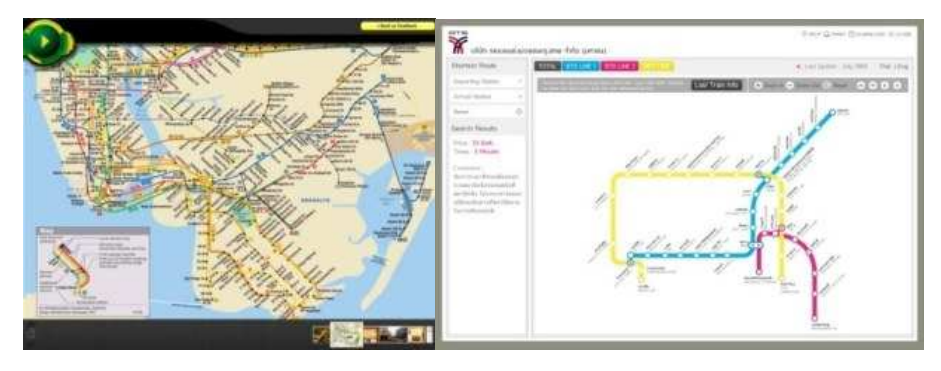
Fig. 4. The first interactive map which is not been selected (too much information on one page) (left) the first prototype screen with white background (right)

selected, even though the database is not so large. The developers decided to change coding style from PHP to array instead. There are pros and cons here: Array style of coding took less time to process and made the system more efficient than PHP because it works on client site, regardless of the operating system, platform, speed of internet connection. However it might make difficulty in the future for developers to edit the code of the program.