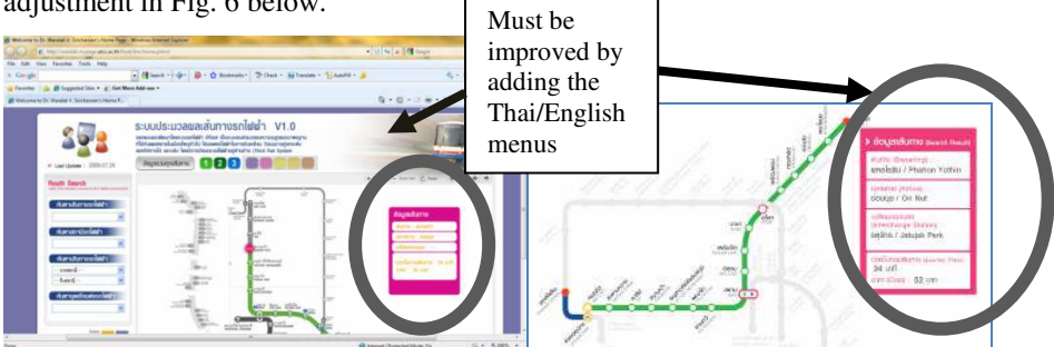
Fig. 6. The final web based interactive map

The last suggestion made by users is to construct the information universal use, which is to make web site available in both Thai and English language as see the last adjustment in Fig. 6 below.