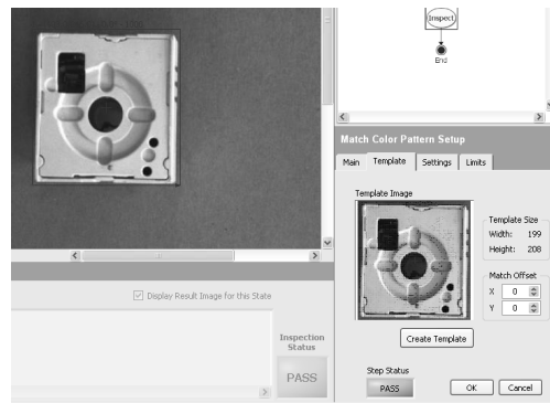
Fig. 2 Match Pattern Color Vision Tool setup.

A particular vision tool called Match Color Pattern Vision Tool (Fig. 2.) was used to detect an object in the field of view. This tool can be found as a part of the vision software (VBAI). In the beginning of the configuration, the tool has to learn a template which contains an object(s) or a feature(s) of interest in the first line. Later, with respect to the learned template, the vision tool searches for similarities in the field of view. The match score is a value that indicates how similar a potential match is to the template image and it ranges from 0 to 1000. A score of 1000 indicates the perfect match. It was determined that a value lower than 800 of the match score results with positioning error which was too large for the developed vision application. Such values were not taken into consideration. The presented method can be used in combination with different vision tools for different purposes.