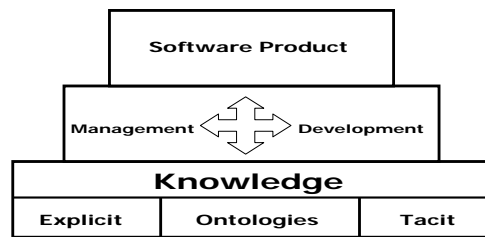
Fig.1. The Software Engineering Pyramid

Fig. 1 shows the basic idea of the above definition.