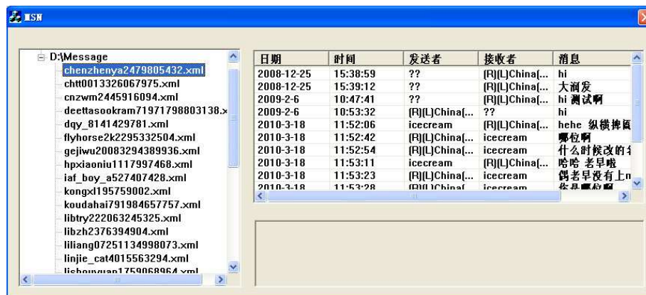
Figure 5. MSN chat records.

user-nick-name is the nickname of conversation counterpart. Each file stores the chat records of the user and file information (name and path) that the user has received. The XML file uses a tree structure to store the chat records (Figure 4).