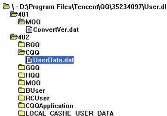
Figure 1. User.db data structure.

MsgEx.db file. The QQ server then performs a second validation before the user can successfully log in. This involves hashing the user-supplied password and comparing the value with the password hash saved in ewh.db.