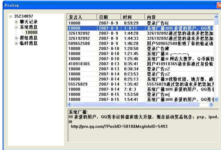
Figure 3. QQ chat records.