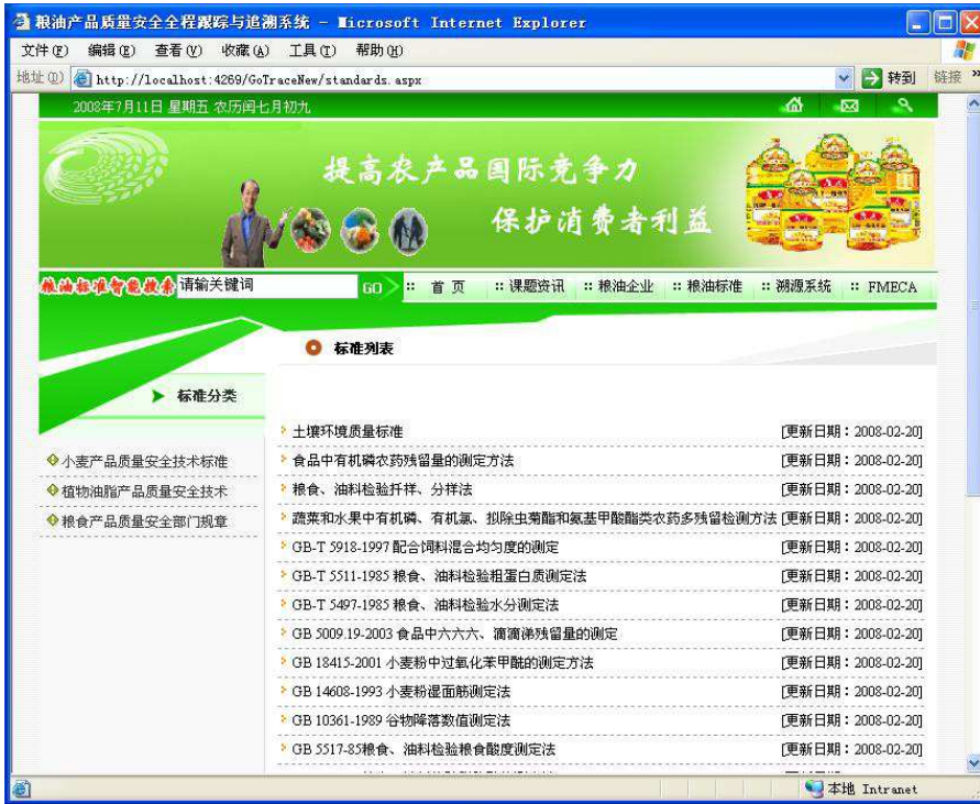
Fig.4 The standards management system in the traceability system

Fig.5 is the expert points function page of FEMCA analysis system. Experts can evaluate the basis of the traceability, the features of every phase, the control measure, and give every indicator a score.