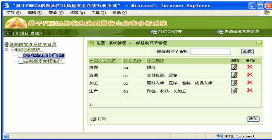
Fig.5 The expert points function of FEMCA analysis system

Fig.5 is the expert points function page of FEMCA analysis system. Experts can evaluate the basis of the traceability, the features of every phase, the control measure, and give every indicator a score.