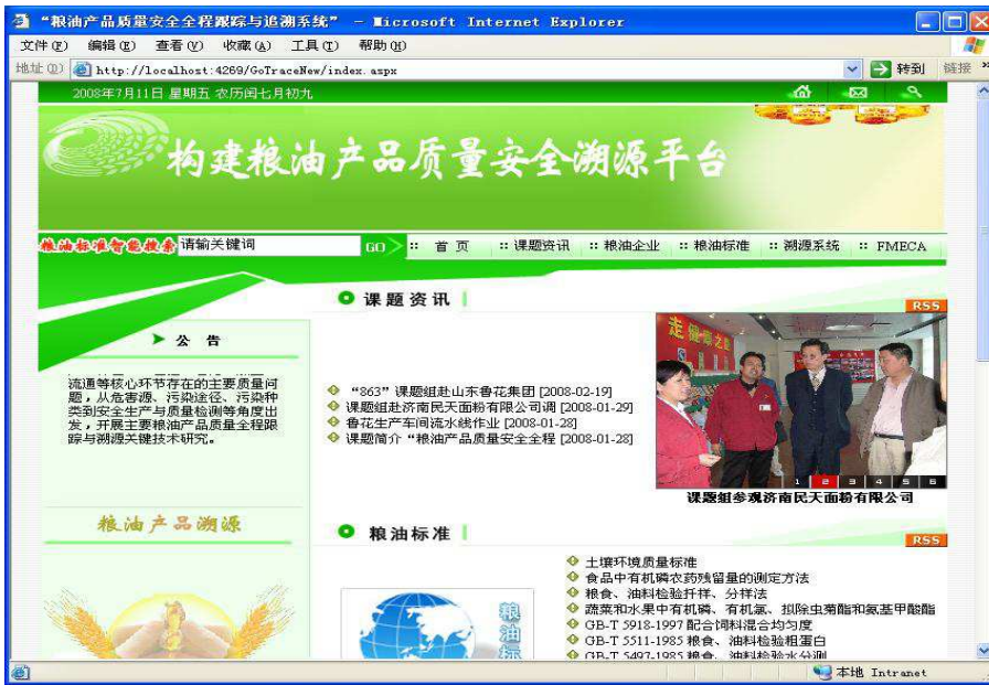
Fig.3 The portal homepage of the system

Fig.3 is the portal of the traceability system. From this homepage, user can visit the related information, and navigate to the subsystem, subscribe related information through RSS, and retrieve the traceability information inside the application.