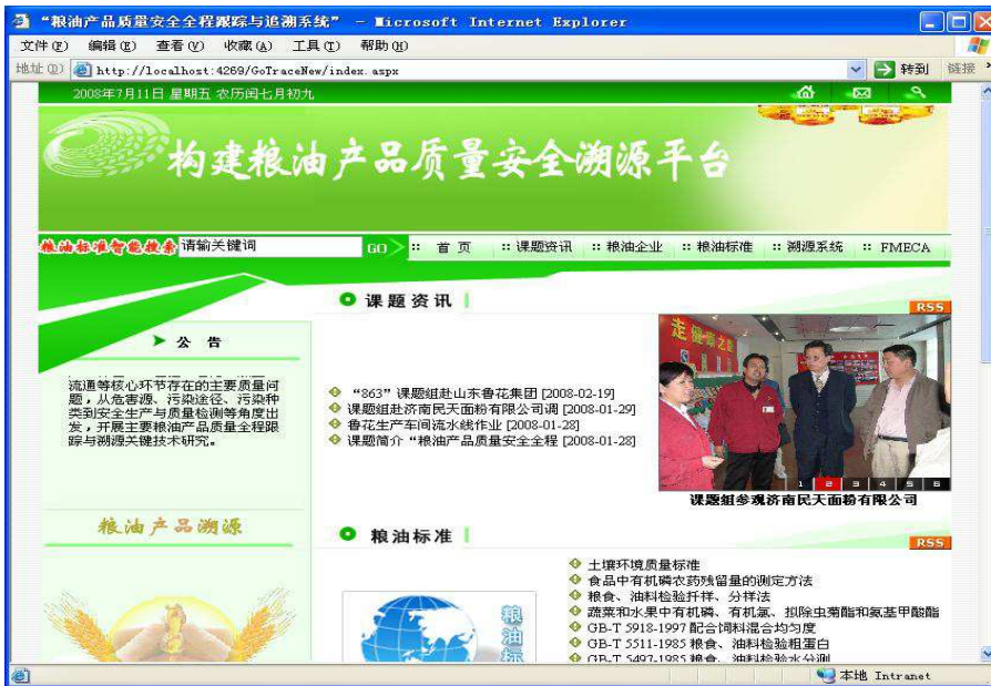
Fig.3 The portal homepage of the system

Fig.3 is the portal of the traceability system. From this homepage, user can visit the related information, and navigate to the subsystem, subscribe related information through RSS, and retrieve the traceability information inside the application.