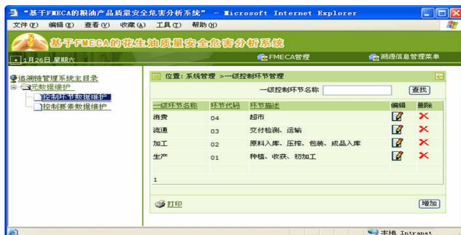
Fig.6 Traceability metadata management sub-system

traceability. These metadata will be used in every phase to describe the features of every product.