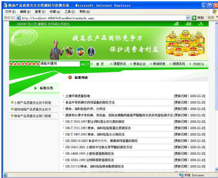
Fig.4 The standards management system in the traceability system

Fig.5 is the expert points function page of FEMCA analysis system. Experts can evaluate the basis of the traceability, the features of every phase, the control measure, and give every indicator a score.