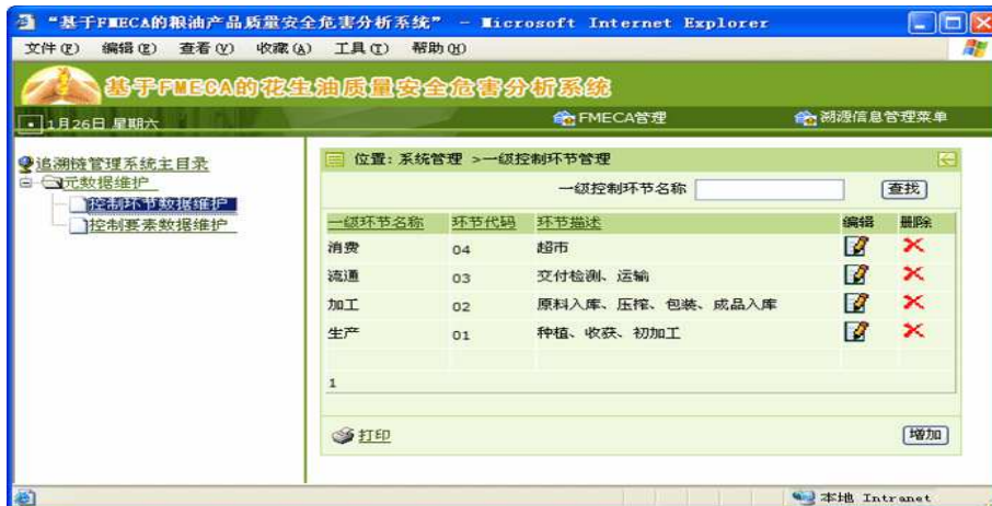
Fig.5 The expert points function of FEMCA analysis system

Fig.5 is the expert points function page of FEMCA analysis system. Experts can evaluate the basis of the traceability, the features of every phase, the control measure, and give every indicator a score.