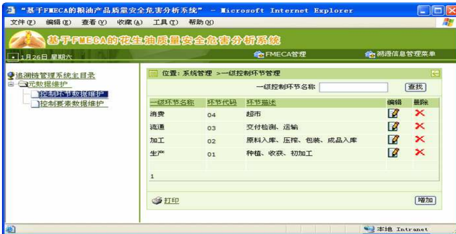
Fig.5 The expert points function of FEMCA analysis system

Fig.5 is the expert points function page of FEMCA analysis system. Experts can evaluate the basis of the traceability, the features of every phase, the control measure, and give every indicator a score.