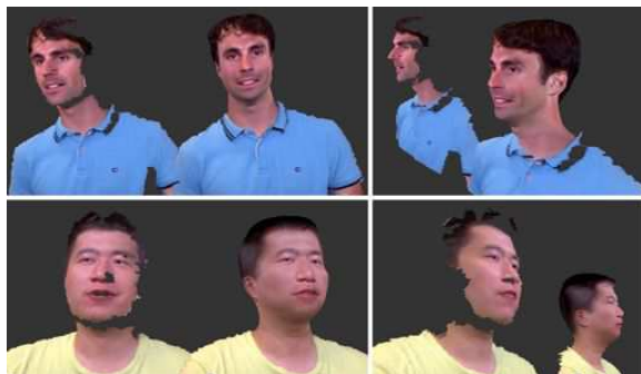
Figure 4: For each image, (left) 3D reconstruction from sensor output, (right) 3D head reconstruction using our method.

Although in our experiments the face tracker provided accurate and reliable results for a wide range of subjects and lighting conditions, it can occasionally fail. When this happens, our method cannot choose the correct head models for the reconstruction and the head model with a neutral face is