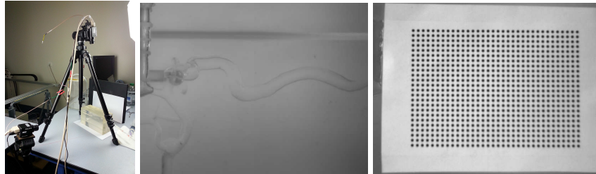
Fig. 2: (left) Experimental setup, showing the top and side camera, observing the silicon vascular phantom; (middle) image of the phantom by the top camera; (right) calibration pattern used to compute the equation of the refractive plane (inter-bullet distance=2 mm)

This test bench is composed of a motorized spool that pulls over one meter of bare electric wire, with a negligible elongation factor and a constant diameter of 1.54mm (close to interventional radiology tools). While the electric wire diameter