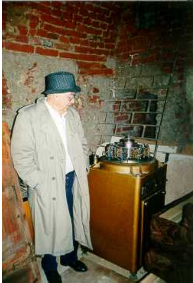
Fig. 5. I found the MECIPT-1 with our drum in a cellar of the Timisoara Fortress (2002)