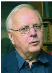
Kristen Nygaard in the mid-1990s

Many people are characterized as great. What constitutes great people? There is no simple answer. How do you measure greatness? Was Professor Kristen Nygaard (1926-2002) a great man? Maybe not, but in our view Nygaard set a high standard against which you can measure other people's greatness.