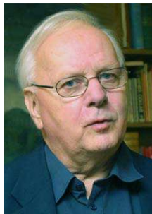
Kristen Nygaard in the mid-1990s

Many people are characterized as great. What constitutes great people? There is no simple answer. How do you measure greatness? Was Professor Kristen Nygaard (1926-2002) a great man? Maybe not, but in our view Nygaard set a high standard against which you can measure other people's greatness.