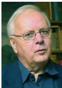
Kristen Nygaard in the mid-1990s

Many people are characterized as great. What constitutes great people? There is no simple answer. How do you measure greatness? Was Professor Kristen Nygaard (1926-2002) a great man? Maybe not, but in our view Nygaard set a high standard against which you can measure other people's greatness.