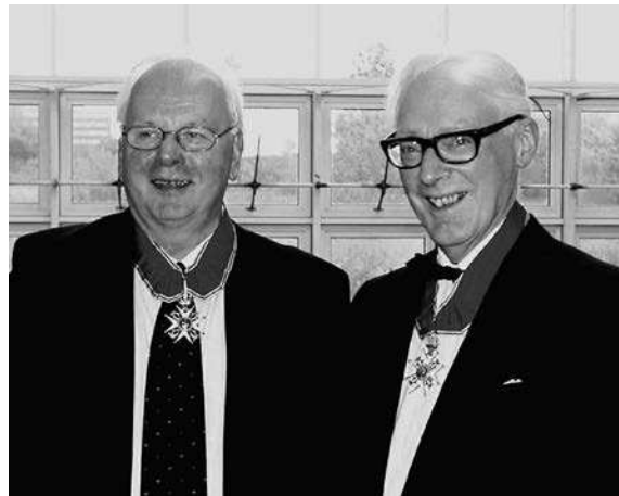
Kristen Nygaard and Ole-Johan Dahl in 2000, proud receivers of recognition from the King of Norway

The major chords of Nygaard’s life’s work are solidarity and empowerment. In his work on computer languages, system development, and object-oriented education, as well as in his work for the homeless, the trade unions, the environment, and the “Nei til EU” movement, he took the side of the common people against the forces of the market. He recognized that the means a person uses to structure his thinking about a phenomenon and his understanding of the world is not neutral. Information technology, he maintained, reflected by and large the worldview of the market in terms of values, power and objectives. His work encompasses a critical re-examination of this, from the perspective of ordinary people, emphasising solidarity, democracy and decent working conditions.