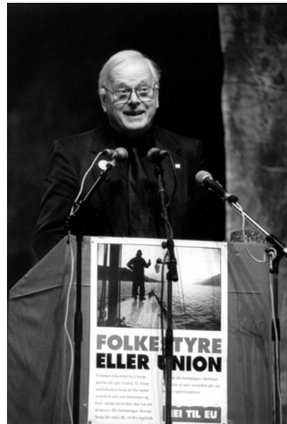
Nygaard at a public meeting in Trondheim 1994, advocating democracy while opposing a union.

Before the Referendum Nygaard took part in a long line of public meetings and discussions with opponents and supporters of EU membership. He was a clever and knowledgeable debater and a worthy opponent to his foremost antagonist, Prime Minister Gro Harlem Brundtland. NTEU disseminated information from a critical point of view about Norway’s relation to the Common Market and coordinated the efforts to keep Norway outside. Before the Referendum on November 28, 1994, NTEU had 145 000 members and succeeded in getting 52.2% of the votes.