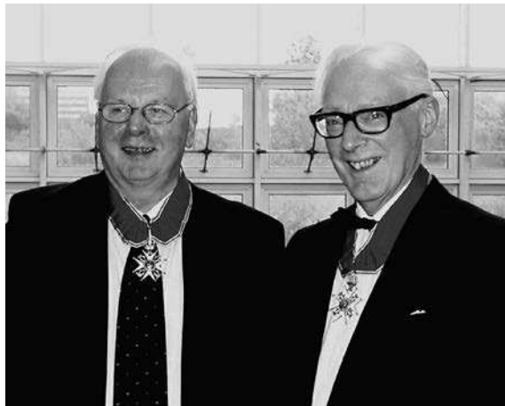
Kristen Nygaard and Ole-Johan Dahl in 2000, proud receivers of recognition from the King of Norway

The major chords of Nygaard’s life’s work are solidarity and empowerment. In his work on computer languages, system development, and object-oriented education, as well as in his work for the homeless, the trade unions, the environment, and the “Nei til EU” movement, he took the side of the common people against the forces of the market. He recognized that the means a person uses to structure his thinking about a phenomenon and his understanding of the world is not neutral. Information technology, he maintained, reflected by and large the worldview of the market in terms of values, power and objectives. His work encompasses a critical re-examination of this, from the perspective of ordinary people, emphasising solidarity, democracy and decent working conditions.