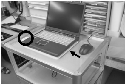
Fig. 3 A wireless LAN terminal at SUH (circle, wireless LAN card; arrow, a vibration-absorbing mat)