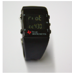
(a) RIOT on Texas Instruments EZ430-Chronos

In addition to testbed environments, RIOT allows for the setup of arbitrary virtual networks. Multiple RIOT native