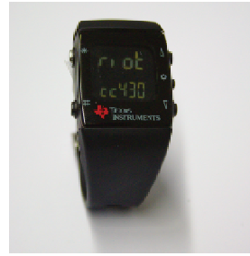
(a) RIOT on Texas Instruments EZ430-Chronos

In addition to testbed environments, RIOT allows for the setup of arbitrary virtual networks. Multiple RIOT native