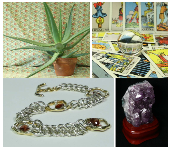
Fig. 2. Example images from the datasets: “ aloe ” from [14] and “ tarot ”, “ bracelet ” and “ amethyst ” from [15].

We have chosen to study 4 different weights for the blending factors. First we consider the “ classic ” weight ((1 - \alpha), \alpha) taking into account the “ minimal angular deviation ”. The second weight also fulfills this property. It is ((1 - \alpha)^2, \alpha^2) . The third chosen weight ignores the “ minimal angular deviation ” and assigns to each image the same weight. This is done independently of the \alpha value and the local deformation of the image transformation. The fourth weight is proportional to the local deformation of the transformation of the image, as described in [7], |\det D\tau|^{-1} . In our case \tau is the transformation given by the disparity and we compute its deformation with finite differences. In all 4 cases weights are normalized so that their sum is 1. If one of the two corresponding pixels is marked as invalid we assign a 0 weight to it, and a 1 weight to the other pixel. If both corresponding pixels are invalid, we mark the pixel as invalid. If one or both of the corresponding pixels are valid, we assign to the final pixel the weighted sum of the values. Notice that at this stage some pixels of the rendered image are labeled as invalid. We explain how we handle those cases in section 3.3.