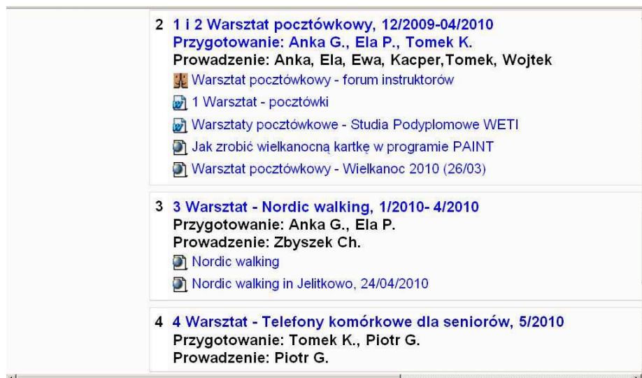
Fig. 2. Example e-workshops offered in LLLab project

Up till now PRO-MED sp. z o.o. delivered the following workshops: