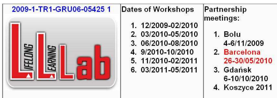
Fig. 3. Example information about LLLab project located in Moodle

The idea of establishing the online e-senior Magazine was born in 2008 during the EDEN Conference in Lisbon. The most interesting projects' events and achievements are documented there as essays [10].