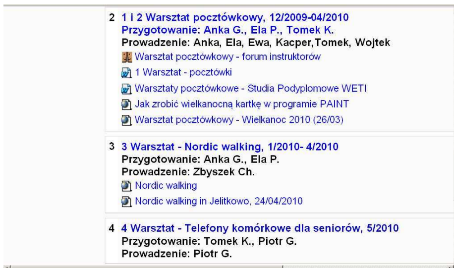
Fig. 2. Example e-workshops offered in LLLab project

Up till now PRO-MED sp. z o.o. delivered the following workshops: