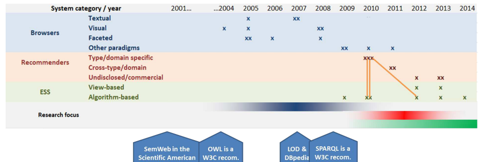
Fig. 2. Systems timeline