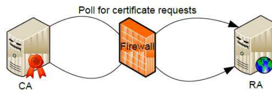
Figure 2. External enrollment method

The users apply for a new certificate using the pages offered by the server. Upon completion, the server will create a certificate request and stores it. At specified time intervals, the Issuing CA polls the RA for the certificate requests, processes the requests internally and issues or denies the certificates. They are sent back to the RA and the users can pick up their certificates. The main advantage of this solution is that it offers further protection to the CA network by configuring the firewall to deny all packets originating from outside the CA network unless they are a response to a CA started connection.