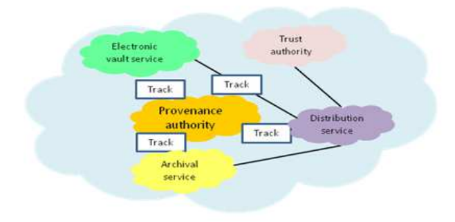
Fig. 2. Managing provenance within a centralized approach

1. Centralized approach (cf. Fig 2): it consists on the definition of a centralized policy for collecting and managing provenance from end-to-end. In this case, a unique trusted authority provides a provenance service. This approach permits to alleviate data structure heterogeneity by using a unique standardized provenance format. However, we have to imagine that this authority can access external clouds through specific API. This authority should provide strong authentication techniques permitting to its clients to trust this centralized service and to communicate without revealing critical information.