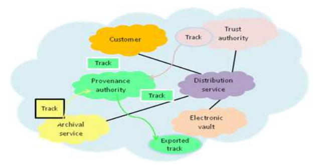
Fig. 3. Managing provenance within a hybrid approach

way, the centralized authority can directly export exploitable provenance to external services requesting it. Within this approach, the provenance authority should define a management policy to alleviate syntaxic and semantic interoperability issues.