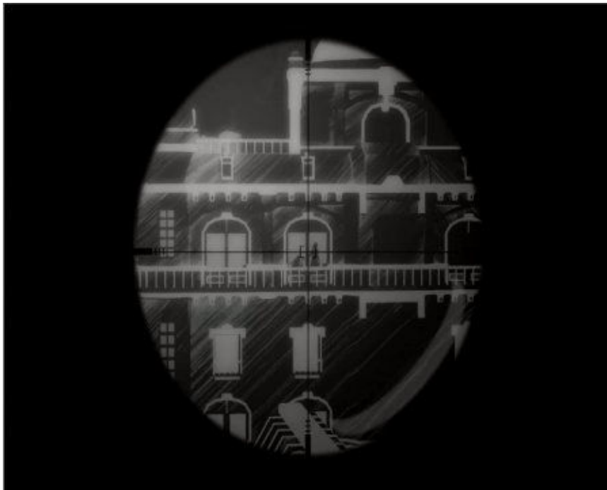
Fig. 1 Looking through the aim in Fear Window

One of the objectives of Fear Window is to get the player to think about what he has just done. We are going to show to him the target's wife and daughter before he arrives to his apartment. When he does, he will almost never be alone, making it hard for the player not to kill him in front of his family. To enhance this feeling of unease and doubt is the fact that the player knows nothing of his target's identity and personality, nothing about "himself", the shooter, nor anything about the person who gave you the target. He will only know his orders to kill someone. This should lead the player to wonder whether it is right to shoot, taking a life he knows nothing about with the push of a button." [5]