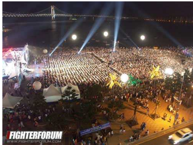
Fig. 4. An e-sports stadium where professional Starcraft games are played

Many publishers now provide players with an engine for generating game content. In the case of Starcraft, the generation engine allowed players to not only create new game maps but it allowed them to modify the fundamental rules of the game. With this new ability, players became level designers and co-authors of the game. Due to the popularity of the Starcraft map editor, the game publisher followed up with another more powerful system with the release of the game Warcraft III,