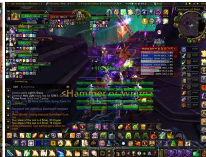
Fig. 6.2. Modified WoW UI for team play

Elitism is a rampant problem in many MMOGs extending well beyond UI and equipment requirements. Certain combinations of avatar race and class can be highly discriminated against. For example, in World of Warcraft if you choose to be a Dwarf, a race that tends to be clumsy but very strong, and you choose to play a Rogue, a class that requires a great deal of stealth and dexterity, while being a perfectly valid race class combination the typical result is a high degree of ridicule by fellow players. Beyond this simple example there have been claims that the overall race design in WoW parallels post-colonialism [7]. The design choice to make Alliance races "familiar" (white Western races) versus Horde races made to be "foreign" (African, Jamaican, Native American, etc.) has caused a tremendous