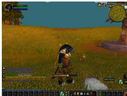
Fig. 6.1. Default WoW UI

While it is possible for users to modify their own user interface, this is a highly complex task and requires some technical knowledge. It has become far more common for player groups to publish their tested modifications for the entire player community to use. This trend has resulted in another change in the game that is somewhat more worrisome. As players progress through the game and reach the upper levels, other players' expectations increasingly include the use of certain modifications. In fact, if a player does not have a minimal set of UI modifications installed they are frequently not allowed to join a group. This can be a serious issue if the formation of a group is necessary to achieve certain required tasks. As teams approach the most exclusive advanced content available only to the highest level players, additional requirements of specific equipment (weapons, armor, exclusive abilities, etc.) are also imposed. This exclusionary behavior closely resembles classism and is a source of frequent frustration for newer players.