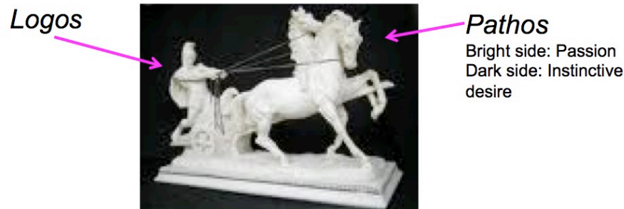
Fig. 2. Logos and pathos.