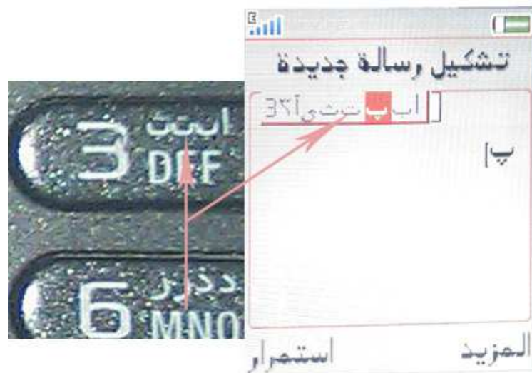
Figure 3. Discrepancy between illustrated and actual number of key press

In general, ligatures and diacritical marks are found by pushing the corresponding letter (often several times), but where the most often used, like ل [lam-alef] would be part of computer keyboards, it is here found by writing these two letters after each other, and then the combination is automatically made. However, as the keypads do not show this, this has to be experimentally found (on trial-error basis). There are of course, as is also the case in Danish and English, many other special characters to choose from, with needs as much as 9 clicks before they appear on screen. Though they are rarely used, and for the most users perhaps newer used, the “interesting” part is to find them, as they are not illustrated on the pads, and they are not always placed at the same place in the phones, similar to Hindi and Devanagari writing discussed earlier.