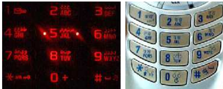
Figure 2. Arabic and Devanagari keypad layouts

These heuristics were applied for Danish, Hindi and Arabic mobile phones, whereas we have referred the existing research on Chinese.