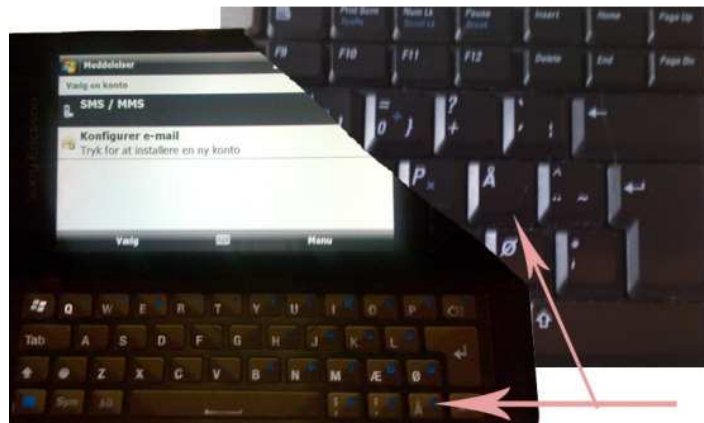
Figure 4. Discrepancy between smart phone and PC QWERTY keyboards

When it comes to the use of smart phones, they often include either a stylus or virtual keyboard in qwerty-style for entering letters, or even in the most modern versions a physical keyboard. In the Xperia version it is however interesting to see how the placement of å is different from the typical Danish qwerty keyboard style (figure 4). For users who are used to writing without looking at keys at a regular qwerty-keyboard, this results in poor speed and disruption of flow in writing (which is especially interesting when investigating interaction with phones for writing mails for work).