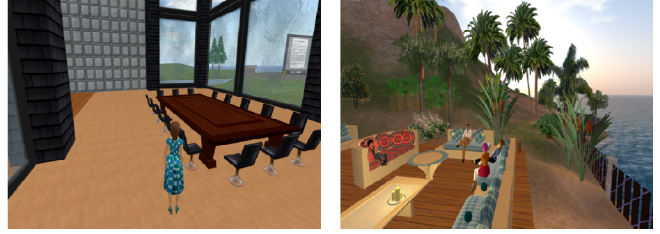
Figure 2. (a) A meeting room; (b) An open-air meeting venue

Consider ambience and aesthetics of the learning space: Ambience and visual aesthetics are important design criteria. Aesthetic designs are perceived as easier to use and promote creative thinking and problem solving (see Figure 2(b)): " If they feel relaxed here -, from visually stimulation, or aural (sound of water flowing)...then maybe they engage more with the tutorial and say more than they would in real-life in lecture hall or for something comparable with MSc usage - they are distance learners and we use discussion boards, skype, wikis, blogs, email..." [SL educator]