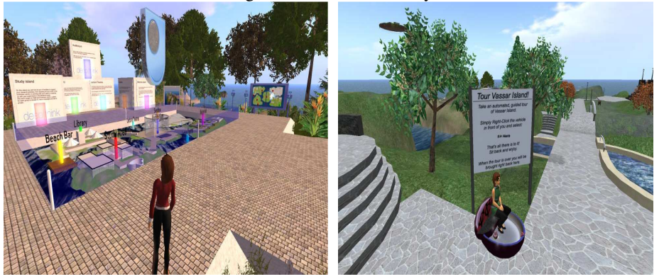
Figure 3. (a) An entry point in Deep Think; (b) Tour in Vassar island

Taking the example of webpage 'stickiness' i.e. the attribute of a site to keep users there and clicking more web pages, SL 'location stickiness' can be enhanced through a well-designed and appropriate arrival point. As one designer commented: "An island has elements of real spaces but also has elements of web-pages. People can be channeled to arrive at a specific point (like with an home page) and this orientation space can be used to provide initial information, engage the user and to show them paths further into the function/space. People are impatient just as they are with web pages. Make them walk everywhere and they won't bother looking. Give them a way to click something and be immediately transported to another part of the space, and they are much more likely to explore deeper." [SL designer]. In Figure 3(b), a tour facility at the arrival point takes the user through the various places on the island to orient and inform the user through a textual commentary.