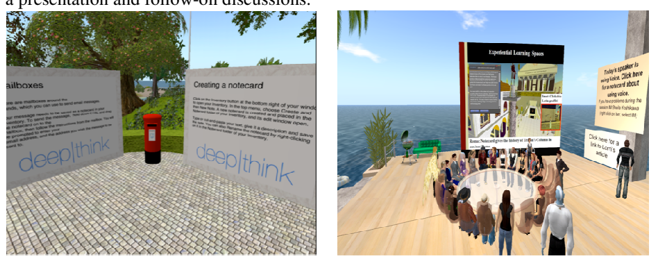
Figure 1. (a) A drop box to collect feedback; (b) A round-table discussion

An educator discussed how the intended function should be integrated within the design: "I say one thing it needs to be very clear what the aim of the space is, ... that should not be because there is a nice sign saying what it is for but it should be in the character of the development. Something in the look and feel, the way you interact with the space is representative of its use so that it will make it easy for the user to understand" [Deep Think]. The objects in the learning spaces should imply the way in which the spaces can be used: "Well, I already mentioned chairs, although totally unnecessary [for the avatars] they do signal that a meeting is going on and certain people have committed to participating for a while" [SL educator and designer]. In Figure 1(b), chairs, a table, slide presenter, posters on the walls have been used to aid a presentation and follow-on discussions.