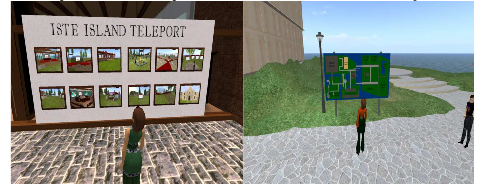
Figure 4: (a) A teleport map; (b) map showing the various places on the island

teleport maps or even maps (see Figure 4) help in orientation and provide robust mental representations of the space and aid the user in route decision-making.