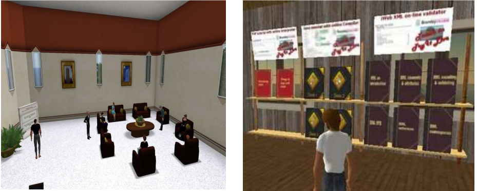
Figure 6: (a) Room without a normal exit; (b) Metaphors for conveying the function

Form should follow function : This principle implies that aesthetic considerations in design should be secondary to functional considerations. The participants mentioned that the design should reflect the learning activities: "... the design should be functionally and pedagogically appropriate, [and] integrated'... a design for a purpose". One educator gave a specific example: "... I actually used objects that looked like books, so the student would go up to a book and the book would open for them ..., so I tried to keep that form and function consistent with real-life and that sort of worked quite well" [SL educator] (see Figure 6(b)).