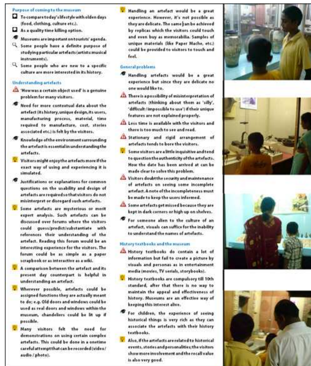
Fig 5. Sample documentation of visitor interviews marked as User statements, Observations, Insights, Design idea / Recommendation, Breakdowns / Concerns, etc along with the photographs of museum visitors

Relevant observations of visitor / social behavior are given in the deliberation on cognitive needs of visitors below.