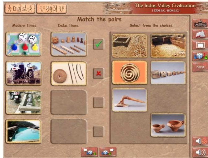
Fig 6. Prototype of an interactive game in which one can match the pairs of objects from 'Modern Times' and 'Indus Times'. It is meant to provoke comparison of lifestyles in the minds of museum visitors. The game presents shuffled examples of dice, toys, plough, spindle and needles, cup, bath, drainage system etc from the modern era and from the era of Indus civilization for comparison. The visitor has to find the matching pairs.