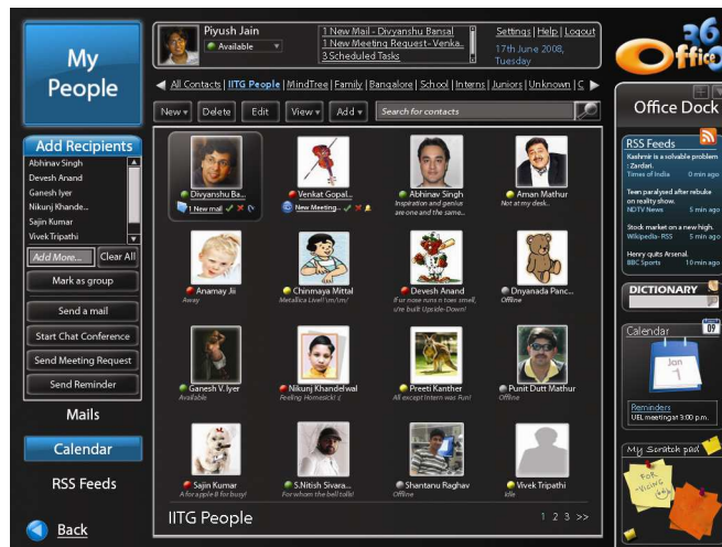
Fig. 4. A screen shot of the final GUI.